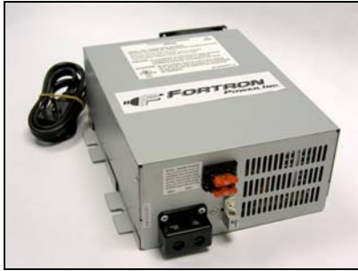
AC to DC Converter &amp; Charger